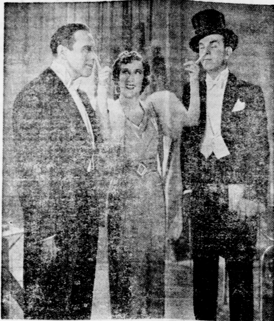
Gracie Allen has the time of her life in "The Big Broadcast of 1937" the all-star comedy coming to the Palace Theatre Preview Saturday night, Sunday and Monday. She is shown above just having a little fun with Jack Benny, who heads the cast, and George Burns, her partner.