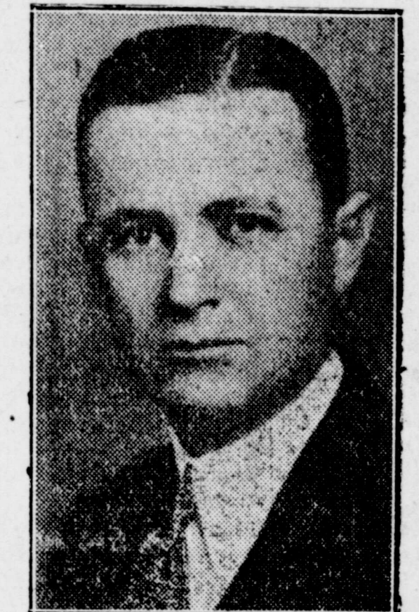
JAMES V. ALLRED The Choice For Governor