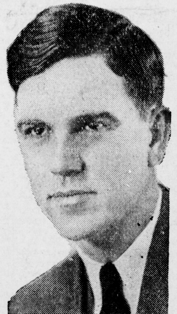
GEORGE MAHON Nineteenth's First Congressman