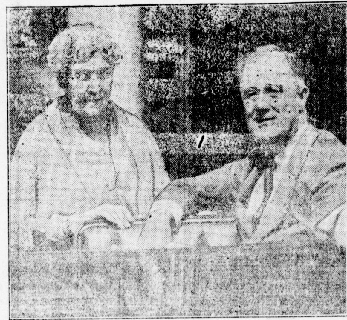
THE PRESIDENT AND HIS MOTHER, MRS. JAMES ROOSEVELT

When the President becomes 52 years old on Jan. 30 every community in the nation will give a ball in his honor to help raise an endowment for extension of the work of Warm Springs Foundation for Infantile Paralysis. The President's mother bought the first box sold for the great society ball to be held in the Waldorf-Astoria in New York, saying: "After all, it is my son's birthday and I am extremely interested in the splendid work of Warm Springs Foundation."