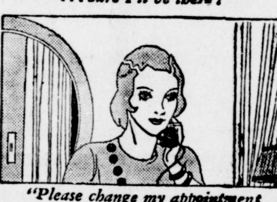
"Please change my appointment to Thursday."