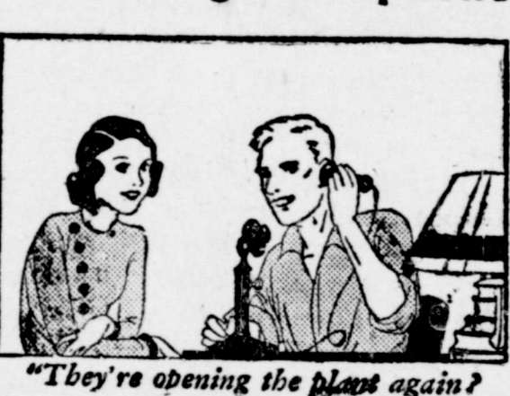
... Sure I'll be there I''