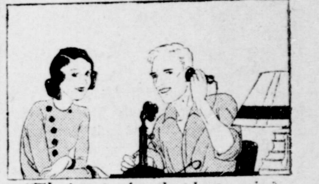
"They're opening the plant again? ... Sure I'll be there!"