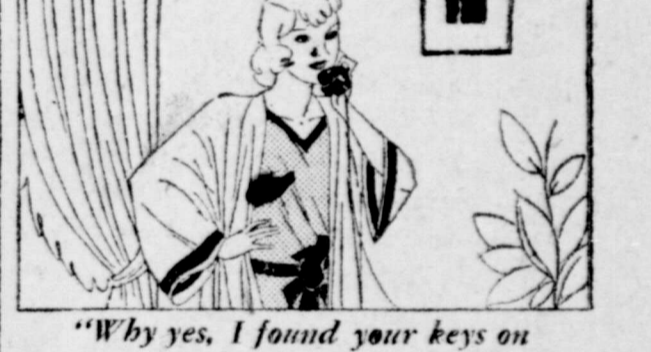
"Why yes, I found your keys on the dresser."