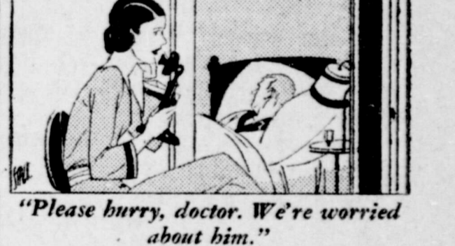
"Please hurry, doctor. We're worried about him."

If you haven't a telephone, we believe you're missing a lot of satisfaction, to say the least. And emergencies do come. At such times a single telephone call may be priceless.