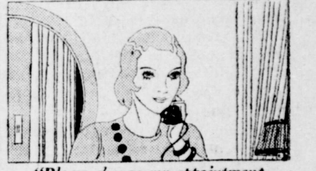
"Please change my appointment to Thursday."