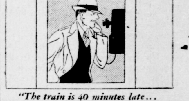
"The train is 40 minutes late... I'll wait for them."