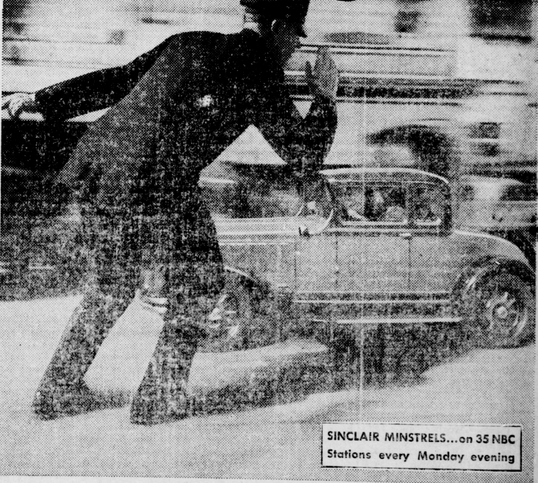
SINCLAIR MINSTRELS...on 35 NBC Stations every Monday evening

Why don't you use "that fast-steppin' gas"?