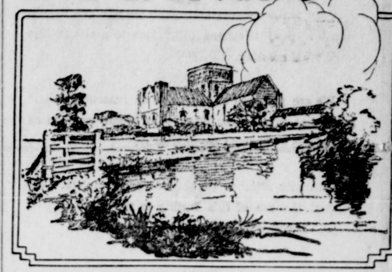
St. Cross, Winchester.

N THIS morning of spring, when the sun, at last, after many weeks of retirement, has shown his golden face above the eastward downs, any cityeven so fair a city as Winchestereems for the moment, undesirable. One seeks instinctively a wider skyspace, hills and meadows, and the flow of the new-fallen waters for company. These are in the valley of the Itchen, writes a correspondent of the Christian Science Monitor