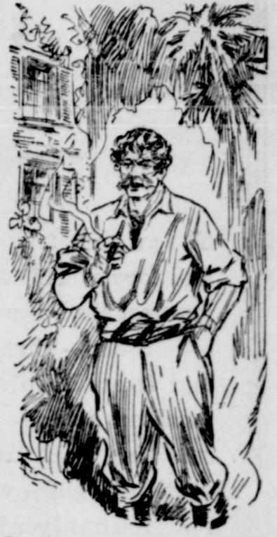
The Old Man Hummed a Jagged Tune.

The old man hummed a jagged tune; in a garden of melody it would have