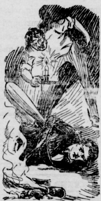
"We Leave You Now. You Will Not Need This Candle to Light You to

They hastened out, and he heard them laughing as they ran through the underbrush. With all his harnessed might he strove to break the paddle so that he might roll toward the door, but it was strong, and he broke only the tip of the blade. A louder crackling told him that the dry boards above were catching. Soon the roof would