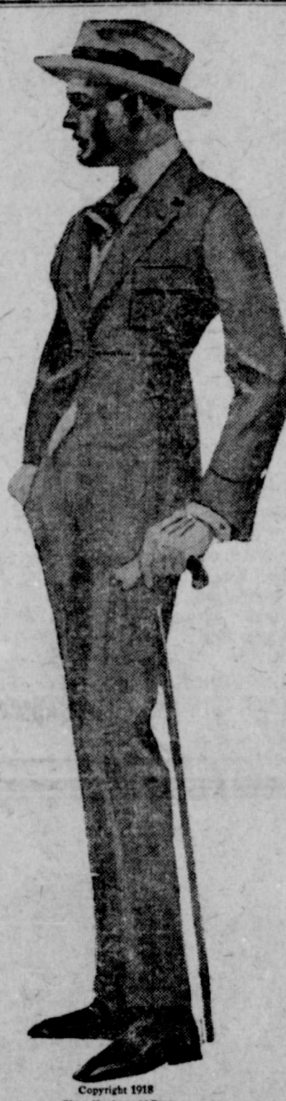
Copyright 1918 Chas. Kaufman & Bros.

If you want the best suit in town, guaranteed all wool, of finest tailoring and make-up, don't pass up this opportunity.