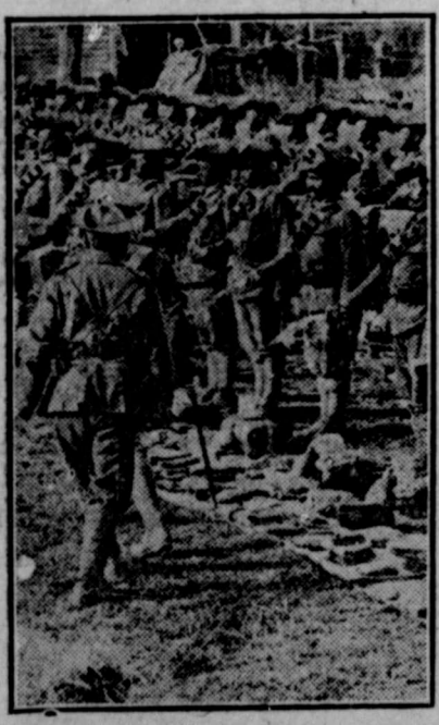
The Gurkhas Pray to Their Koorkree, Most Murderous Looking Knife.

The Indians are the most religious eople I ever saw. They seem to live only for their religion, and all their ac-