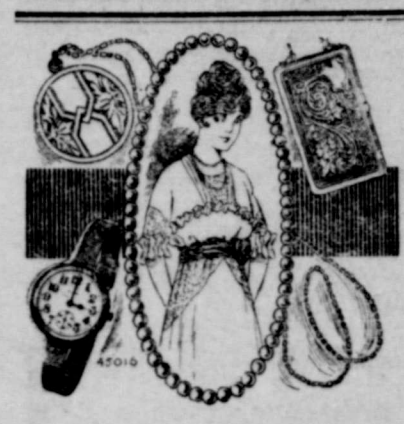
Don't Hesitate to Ask