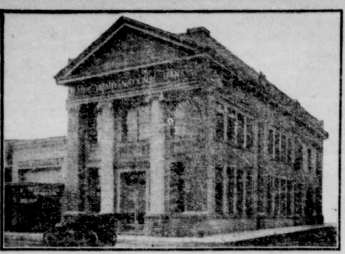
Make OUR Bank YOUR Bank