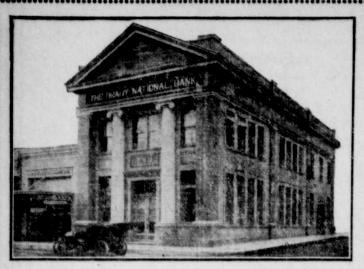
Make OUR Bank YOUR Bank