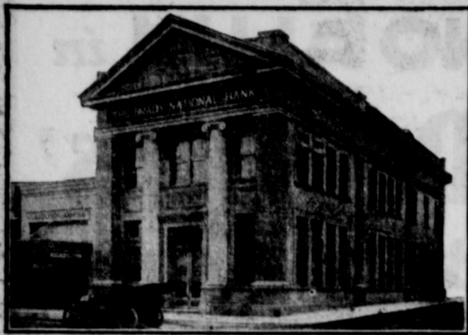
Make OUR Bank YOUR Bank