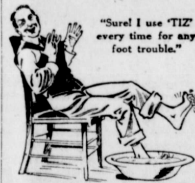
"Sure! I use 'TIZ' every time for any foot trouble."

You can be happy-footed just like me. Use "TIZ" and never suffer with tender, raw, burning, blistered, swollen, tired, smelly feet. "TIZ" and only "TIZ" takes the pain and soreness out of corns, callouses and bunions.