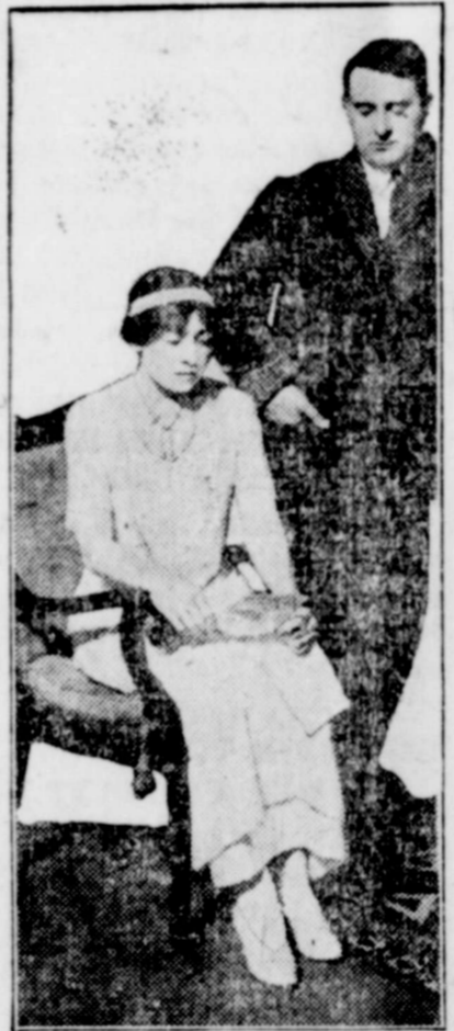
"The War's On and My Hands Are Freed!"