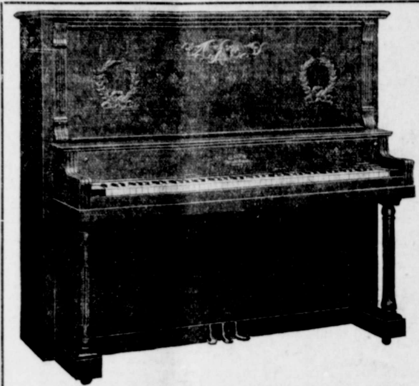
The Elegant $400.00 Claxton Upright Grand Piano. Guaranteed for Ten Years. NOW ON EXHIBITION AT JONES DRUG STORE

Names of Contestants will not be known, but each Contestant will be given a number instead. Every Contestant gets 2000 Votes to start with. Votes once deposited in ballot box cannot be transferred to another. Votes should be tied securely in packages with Contestant's number and amount on top slip. Count will be made every Wednesday afternoon—date of first count to be announced later.