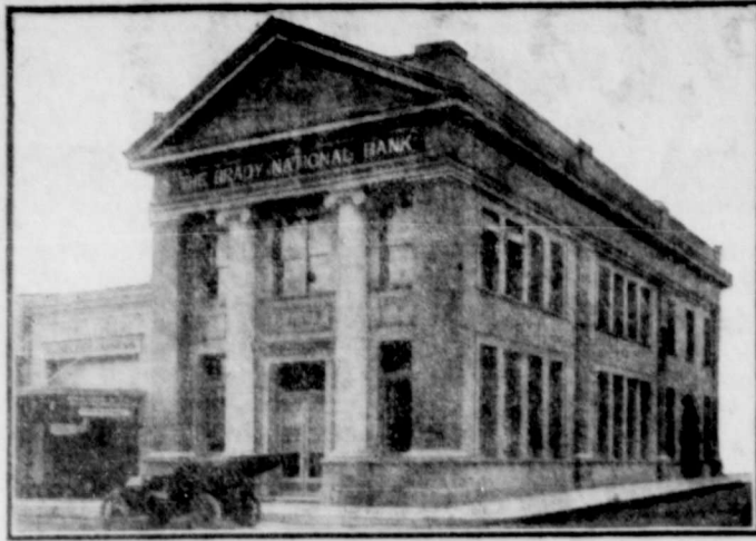
Make OUR Bank YOUR Bank