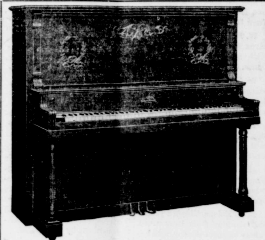
The Elegant $400.00 Claxton Upright Grand Piano. Guaranteed for Ten Years. NOW ON EXHIBITION AT JONES DRUG STORE

RULES OF CONTEST Names of Contestants will not be known, but each Contestant will be given a number instead. Every Contestant gets 2000 Votes to start with. Votes once deposited in ballot box cannot be transferred to another. Votes should be tied securely in packages with Contestant's number and amount on top slip. Count will be made every Wednesday afternoon—date of first count to be announced later.