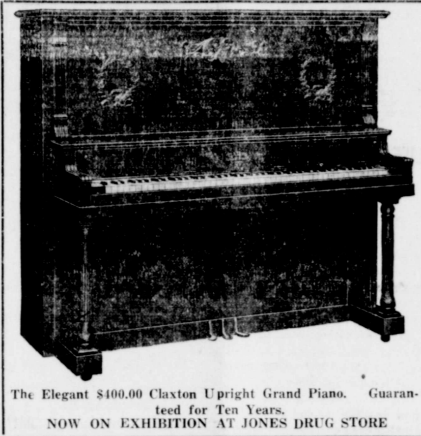
The Elegant $400.00 Claxton Upright Grand Piano. Guaranteed for Ten Years. NOW ON EXHIBITION AT JONES DRUG STORE

Names of Contestants will not be known, but each Contestant will be given a number instead. Every Contestant gets 2000 Votes to start with. Votes once deposited in ballot box cannot be transferred to another. Votes should be tied securely in packages with contestant's number and amount on top slip. Count will be made every Wednesday afternoon—date of first count to be announced later.