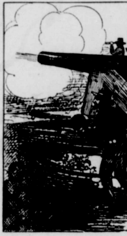
The First Gun of the Civil War Went Off With a Roar.

"Back there in Virginia where the fight for and against secession had