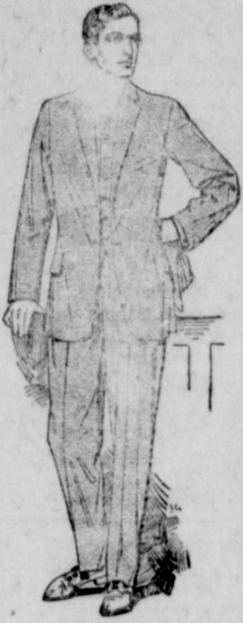
Plate No. 1303

comes on March 23rd. It has not been so early for ninety-five years, nor will be again for eighty-seven years. Make a record by ordering your tailoring now and be ready in time for this, the earliest Easter that our generation will see. Select your goods from "The Tailoring You Need," made by A. E. Anderson & Co. You will get prompt service and thorough satisfaction.