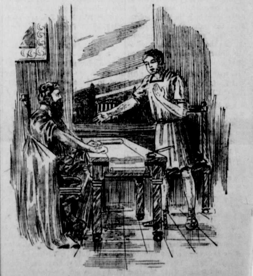
PLATO REPREHENDING HIS PUPIL.

Many of our citizens vote a ticket according to custom without reference to party platform or to the ability of candidates. We can permit ourselves to be such complete slaves of custom that we lose our identity and become the property of politicians. No country can prosper where the noble impulses of progress are fettered by the coils of custom and whose citizens follow in blind adherence the paths of habit.