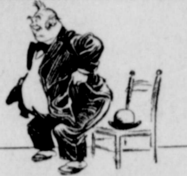
YOU CAN PUT ALL YOU'VE GOT ON "STETSON HATS." THEY ALWAYS KEEP THEIR SHAPE.

The only Dry Goods or Grocery Store in town where you can get votes in the Piano Contest. --