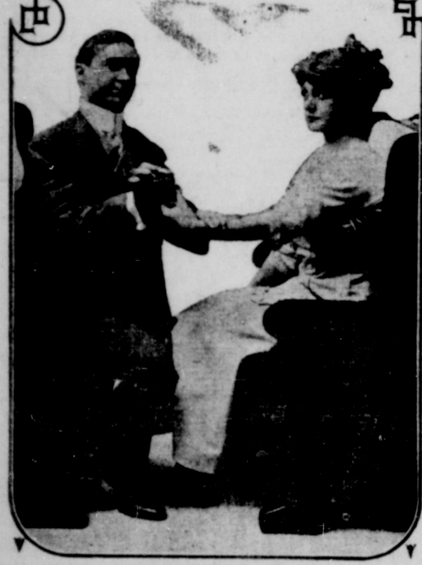
THE WEDDING RING IS FOUND.

Old papers at this office, 20c per bundle of 100.