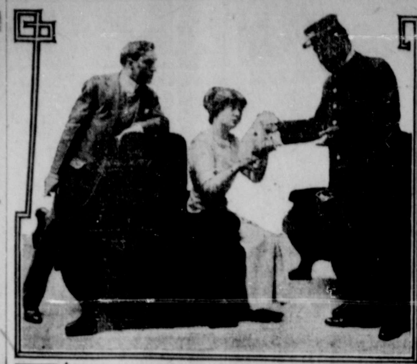
"QUICK-HIDE HIM-HURRY!" SHE GASPED.

He saw two or three other clerical persons in that car, but feared to touch their shoulders. One man in the last seat held him specially, and he hid in the turn of the corridor, in appearance, and wore heavy spectacles and a heavy beard, which Maklory took for a guaranty that he was not another actor. And he was readproofs. Mallory felt certain that they were a volume of sermons. He lingered timorously in the environs for some time before the man spoke at all to the dreary-looking woman at his side. Then the stranger spoke.