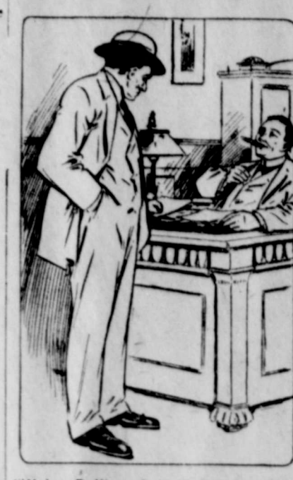
We're Pulling Out of the Financial Pawnshop in Fine Shape.'

against him. Daylight was interested. "It's Slosson," the barkeeper told him, in answer to his query. "He's P. O. Box 453. the heavy-hammer thrower at the U