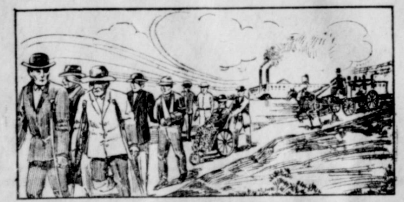
THE TEXAS CASUALTY LIST IS APPROXIMATELY 9,000 PER ANNUM.

Compensation of Employees for Casualties Occur- state is now being harvested. be hardly any end to the in- spending a few hours in the teed to live, a successful busiing in Course of Employment.