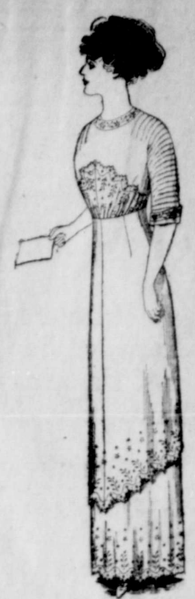
McCall Patterns No. 4157—Waist. No. 4156—Skirt Price, 15 cents each A SMART FROCK

We have just received a new shipment of McCall's Patterns and will continue to handle the same for the benefit of our customers. Call in and get a fashion sheet.