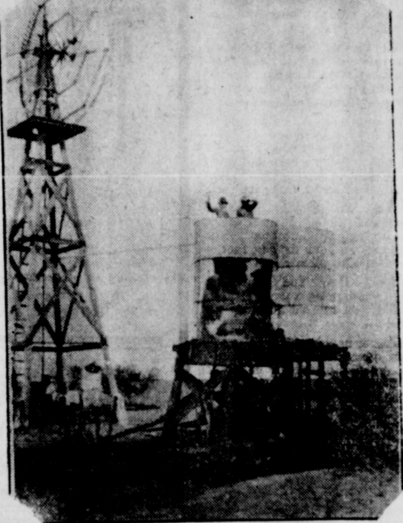
PRODUCING OIL WELLS AT LOHN.