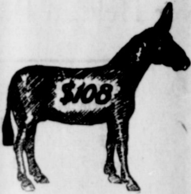
1910 VALUE PER HEAD $108.

The Bray of the Texas mule is heard across the world, for wherever he goes he lustily sings the praises of his native land. He is the most sturdy farmer and the most successful miner of the animal kingdom. He is the only animal that did not enter Noah's ark. By good conduct he has overcome the prejudices of an illegitimate lineage and has successfully fought his way into the highways of industry with his parents as competitors, until today he drags the nation's commerce. He is a self-made animal. Year by year he has patiently studied new occupations and adapted himself to changed conditions until he is the master of more industrial pursuits than any other animal and he is by far the Commercial King of Beasts. He has arisen from obscure origin to the wealthiest of domestic animals; he is worth $28 per head more than the Texas steer, six times more than the Texas horse, and fourteen times more than the hog.