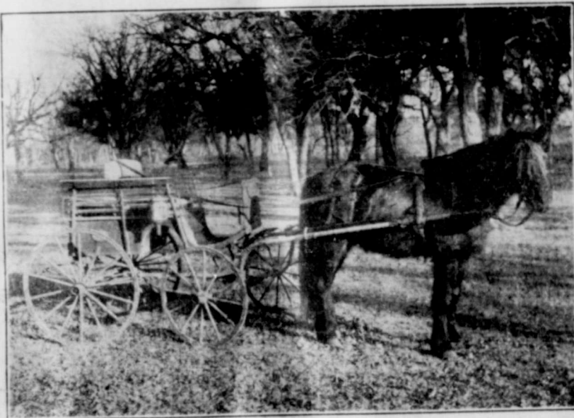
"RUFUS" THE GRAND PRIZE

M..... These free votes must be voted on or before April 10, 1911, in order to be accepted and counted. All free newspaper coupons not voted by April 10th, 1911, are void. No money is required with these votes. Every reader of The Brady Standard should support their favorite candidate and help him be a winner.