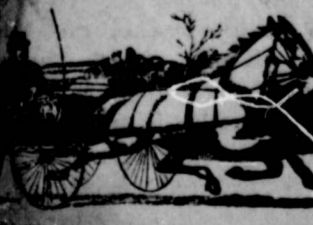
Cheaper to Walk Than to Ride.