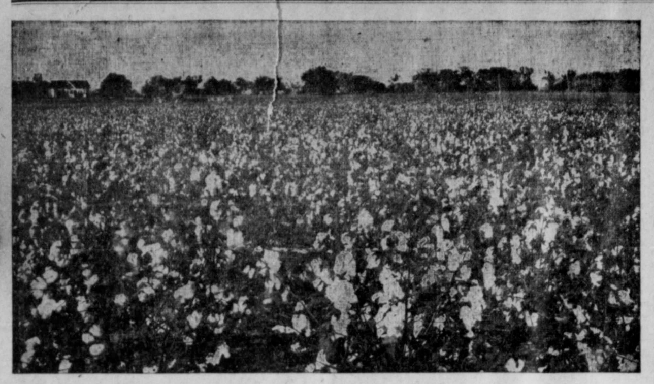
MCCULLOCH COUNTY COTTON FIELD.

Interesting Items From McCulloch's Second parties. City Clipped From the Rochelle Record.