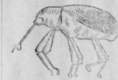
Boll Weevil $1,000,000.

The ravages of the boll weevil "exas are estimated at millions of dol lars, but the mud hole has been a more cently foe to the producer than the bell weevil. The Federal government has spent over a million dollars in ing to find a way of eradicating the bell weevil, but we do not have to bad roads-build good ones