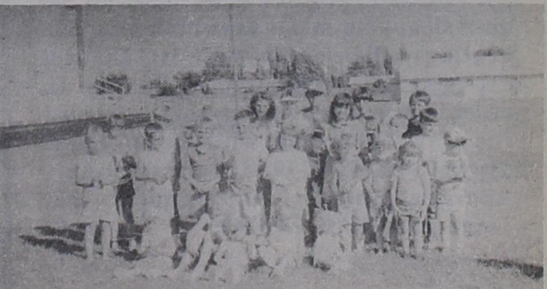
Winners of the pet show, held on July Fourth, are shown with their ribbons.