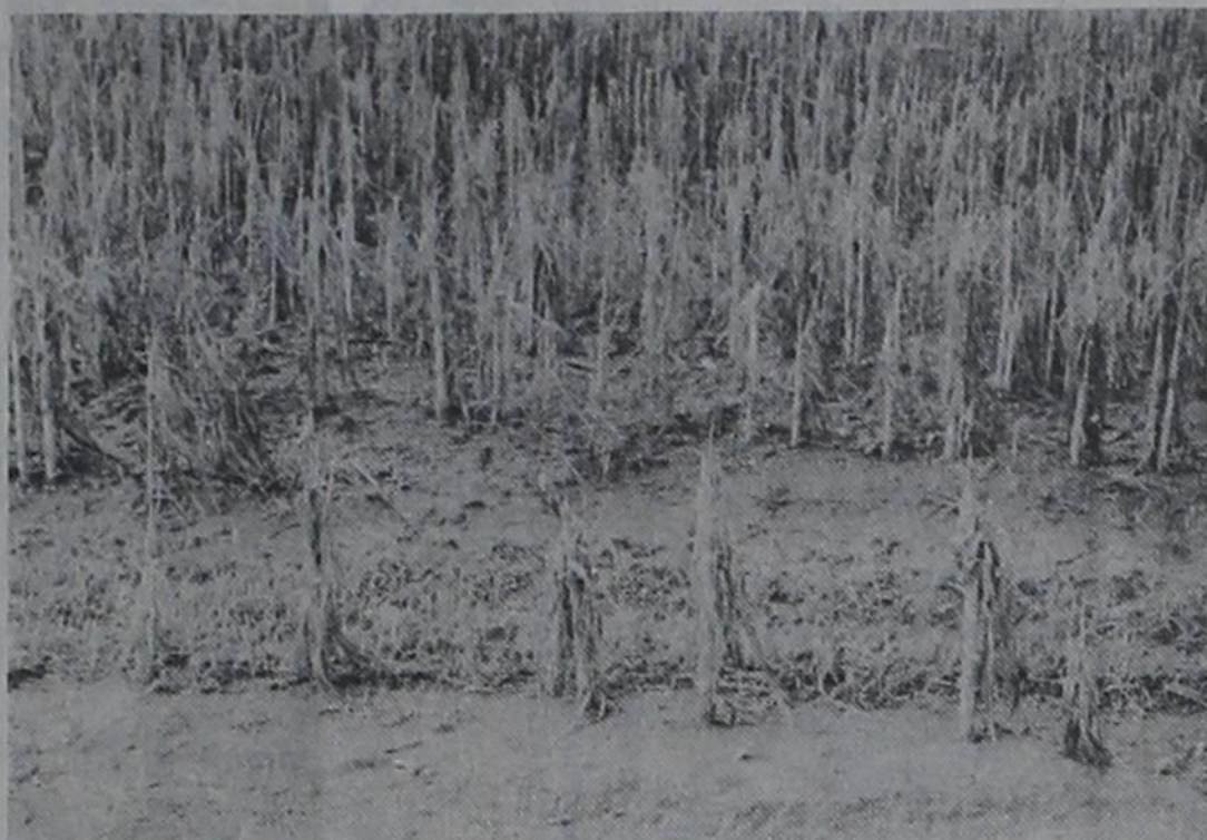
CROPS DAMAGED...Shown is a corn field after a hail storm a week-ago Monday night west of Bovina that completely wiped out many corn crops. This picture was taken on the Greg Bell farm.

There will be clothing for all ages, also kitchen utensils and many other items.