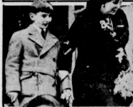
BOY KING —Eleven-year-old Peter, new boy king of Jugoslavia, and his grandmother, Queen Marie of Roumania. He will rule his turbulent kingdom under a regency during his boyhood.