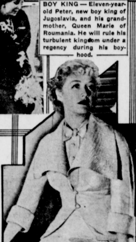
GOLD AND GLITTERING —Gold lamé is used in the creation of this stunning evening ensemble worn by Miriam Hopkins, picture star. The tailored motif so new in formal evening wear is reflected in the bodice and in the treatment of the jacket.