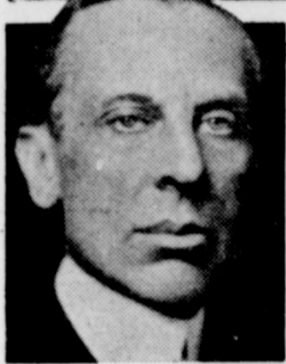
ROAD TO PROGRESS —"To achieve progress," declares Alfred P. Sloan, Jr., President of General Motors, "we must encourage constructive effort, stimulate the exercise of initiative, and establish confidence in the belief that constructive performance justifies the opportunity of reasonable reward." His views are published in The American Magazine.