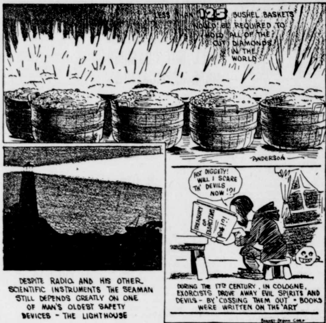
DESPITE RADIO AND HIS OTHER SCIENTIFIC INSTRUMENTS THE SEAMAN STILL DEPENDS GREATLY ON ONE OF MAN'S OLDEST SAFETY DEVICES - THE LIGHTHOUSE