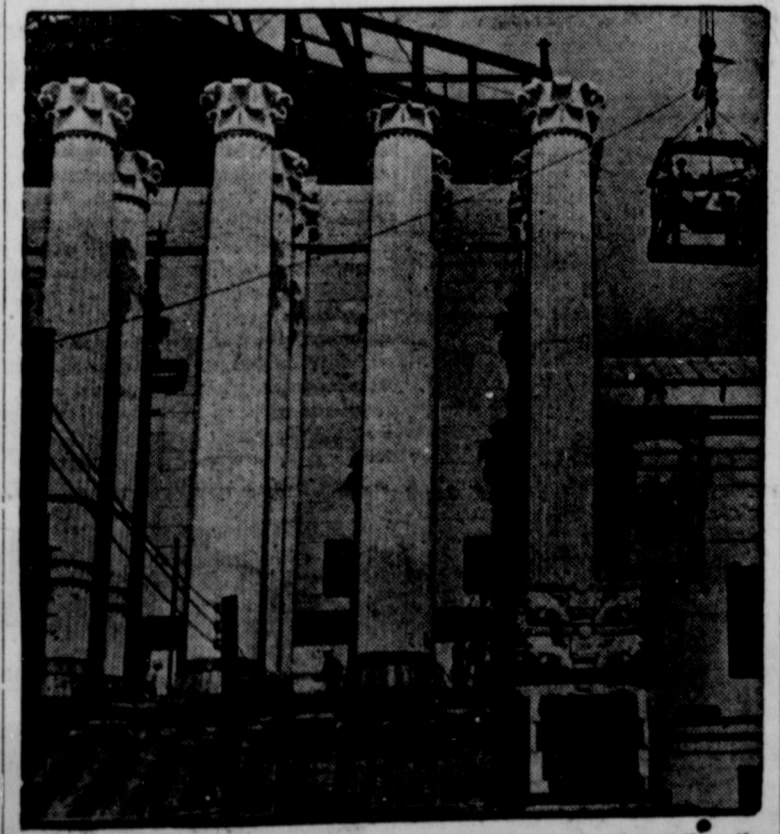
This photograph shows the progress on the work of erecting the new building for the United States Supreme court in Washington. The handsome structure is nearing completion.