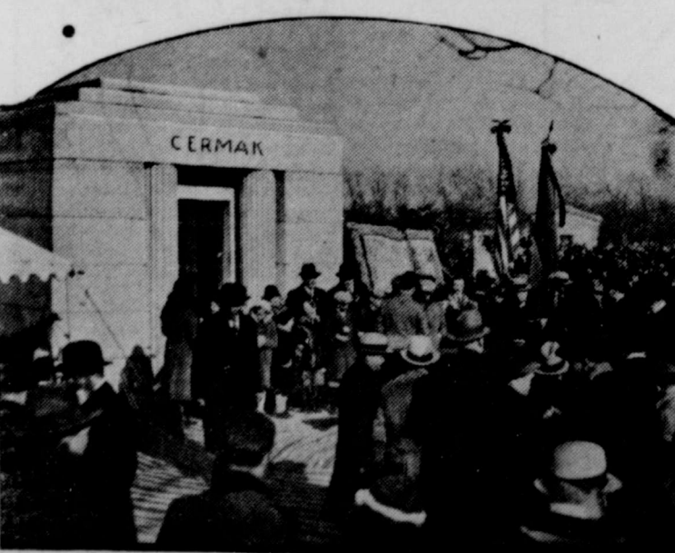
Scene in the Bohemian National cemetery in Chicago as the remains of Mayor Anton Cermak, victim of a bullet intended for President Rosse