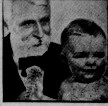
How to train BABY'S

Babies, bottle-fed or breast-fed, with any tendency to be constipated, would thrive if they received daily half a teaspoonful of this old family doctor's prescription for the bowels That is one sure way to train tiny bowels to healthy regularity. To avoid the fretfulness, vomiting, crying, failure to gain, and other ills of constipated babies.