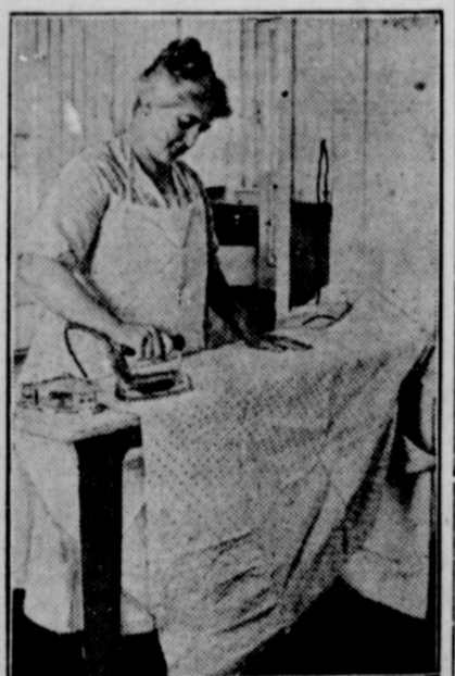
Hinged Leg Provides Support for Board at Right Height.

When other improvements were being made in the kitchen at the suggestion of the home demonstration agent, one Massachusetts farm woman had her ironing board hinged so that it would fold away into a narrow closet, if not in use. A hinged leg provided the necessary support for it at the best height for her to work. The electric plug was located conveniently,