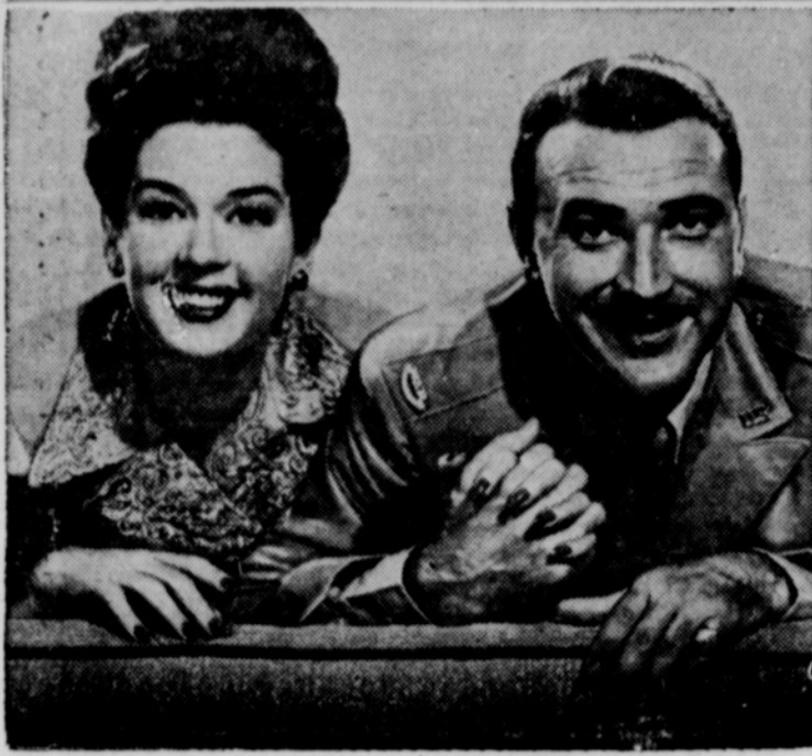
Psychoanalyst clasps hand with cartoonist when Rosalind Russell and Lee Bowman fall in love in Columbia Pictures' new comedy, "She Wouldn't Say Yes," currently starring the pair at the Plaza Theatre Sunday and Monday. But first, there are a lot of inhibitions that have to be chased away.