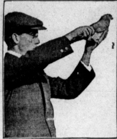
Starting a Homer on Its Journey.

The homing pigeons, bred and owned by the bureau of animal industry, United States Department of Agriculture, at the government farm, Beltsville, Md., have established a record during the past three years which stands alone and unequalled. Beginning with 1919, the year in which the loft was established, the Beltsville birds won first and second in the 100-mile and first in the 200-mile young-