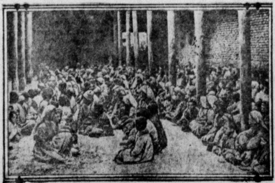
As cold weather sets in refugees are pouring into Near East Relief centers week, returning home Sunday. They This group is fed daily in the former Russian barracks at Alexandropel, one killed four bucks and six turkeys, and of the safest cities in the Caucasus.