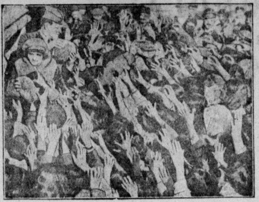
New East Relief Workers Distributing Bread to Newly Arrived Armenian Refugees in Constantinople.

The Constantinople district of the Near East Relief is wonderfully organized. All the bakeries which formerly supplied the Turkish army, under German management, have been taken over by the Near East Relief, and 20,000 loaves of bread are baked and distributed daily. Placed side by side, these loaves would make a line 280 miles long, for the five months that the chorus on without tights or not Near East Relief has operated its consolidated bakeries in Constantinople, putting them on at all. They put