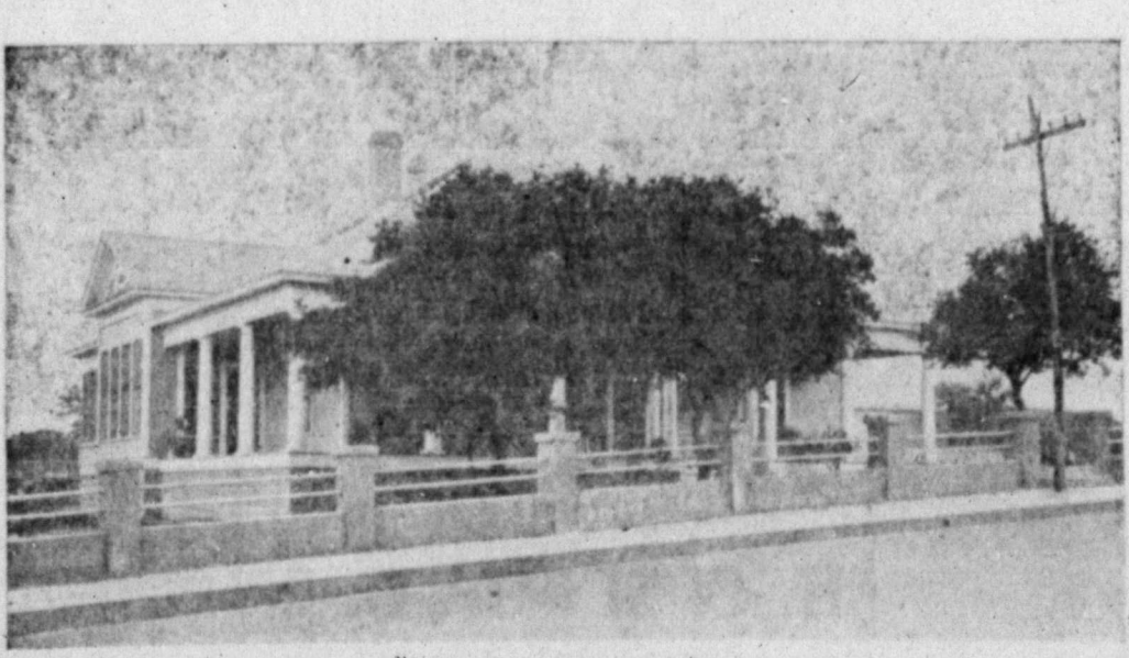
SID PETERSON'S RESIDENCE