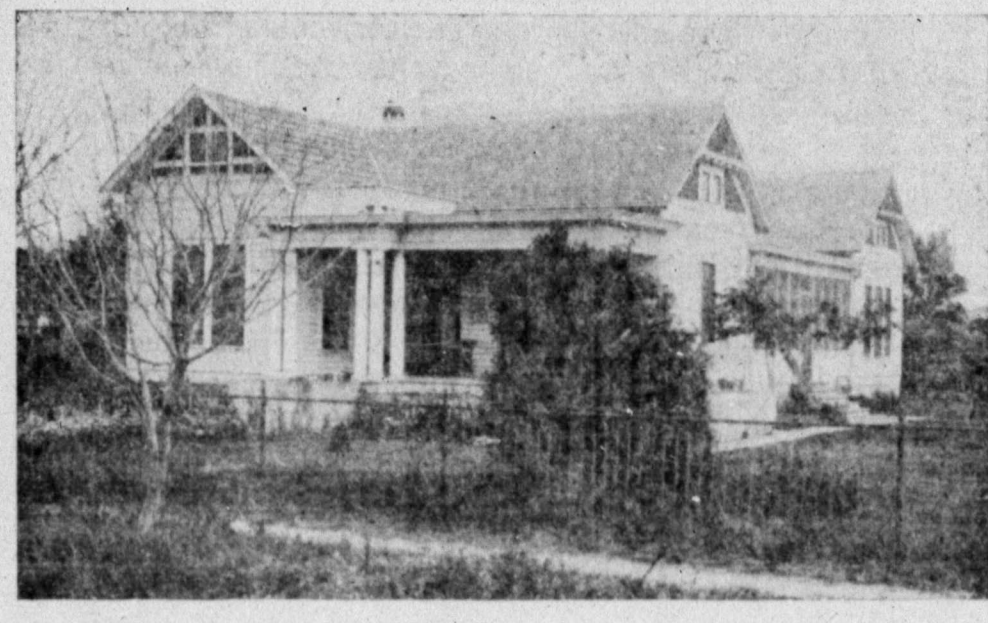
RESIDENCE OF EARNEST SCHWETHELM