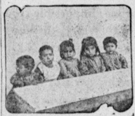
The Table Is Now 24 Miles Long.

But there the table is, seated on both sides with orphans-Syrian and