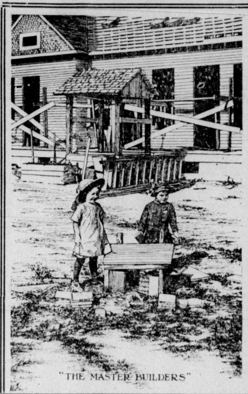
"THE MASTER BUILDERS"