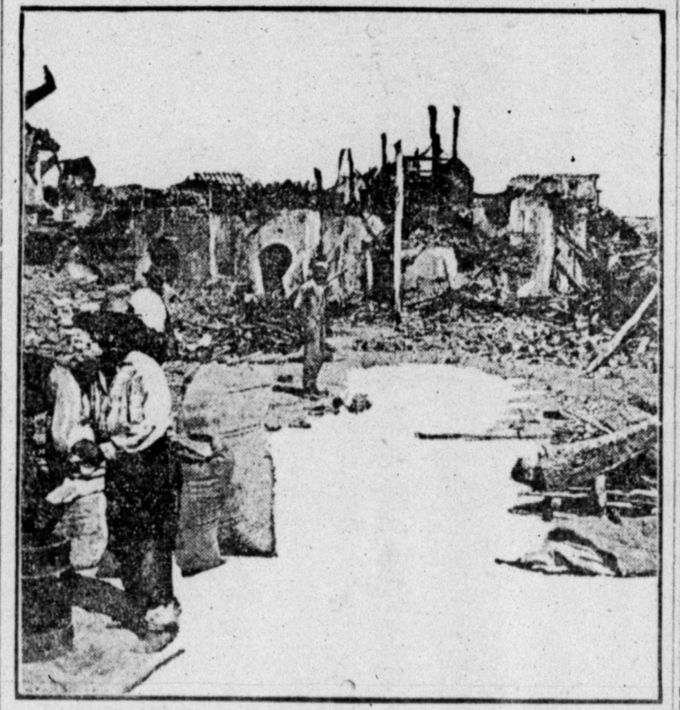
Disastrous Results of a Prior Earthquake in Italy When Ferruzzano Suffered Almost Total Destruction and Many of Its Inhabitants Were Killed by the

down between Governor Campbell rectors. and the Commercial Secretaries On motion the president was inmeeting" than is represented in might require. this instance, and as is usually the The election having taken up ease in such circumstances, both considerable time, nothing outare wrong. If the strength of the side of routine work was discusswided the country will probably equipped, and ready for business. fare well, but if either faction has and much good work is presaged full control, harm is likely to re- by the harmonious action of that sult to the State.