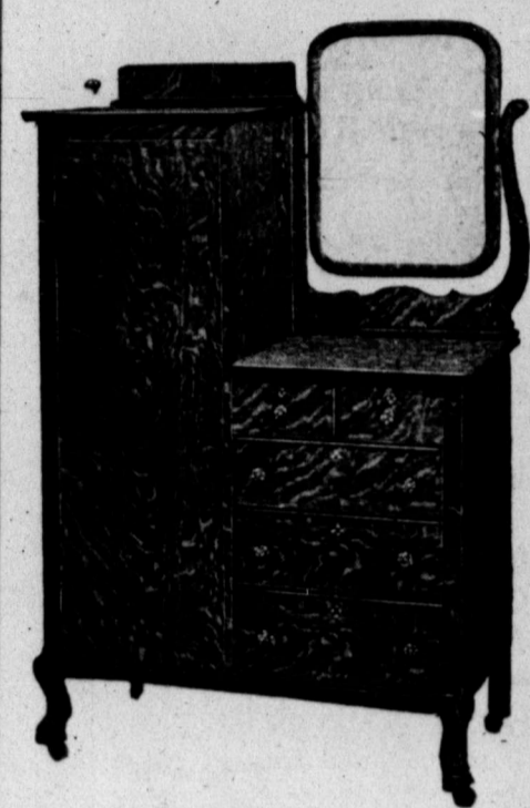
THE WARDROBE DRESSER.

You have been trying to think what would please your wife best for Christmas. Come to our store and let us help you figure it out.