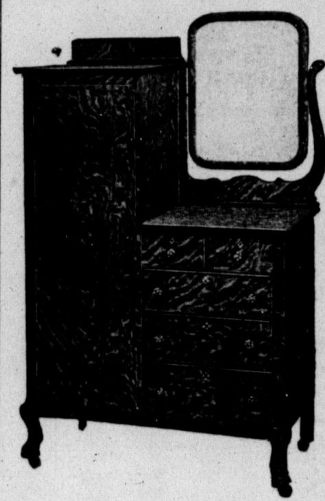
THE WARDROBE DRESSER.

You have been trying to think what would please your wife best for Christmas. Come to our store and let us help you figure it out.