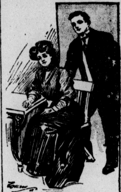
"The Awakening I Longed For Has Come at Last."

Archie was a powerful swimmer and in two strokes he reached the