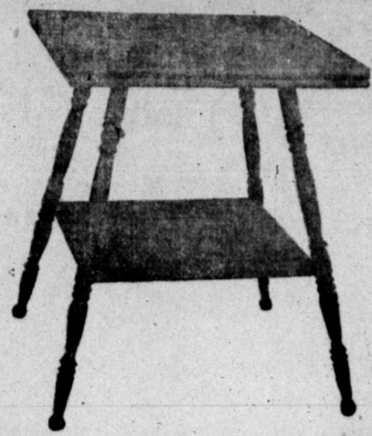
Solid Oak Center Tables, 24x24 $1.50; 16x16 95c

$1.00 DOWN WILL BUY $10.00 Worth of Furniture