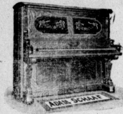
It Will Pay You To See My Instruments and Get Prices and Terms.

What's the Use Ordering An Instrument, or Buying From San Antonio, When You