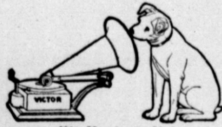
His Master's Voice.

A fair profit is all we ask, we always try to so treat our customers that they will stay with us. Big stock of Winter Goods, Clothing, Hats, Dress Goods, Etc.