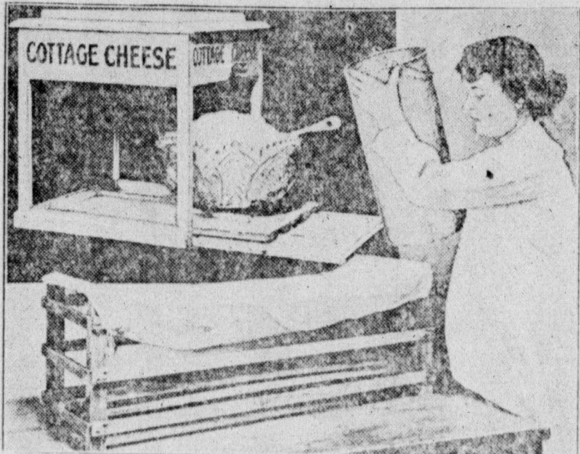
Made Into Home Cheese, Skim Milk Has a Value Many Times Greater Than as a Stock Food Turned Into Meat—Glass Case (Top) Displays Cheese Attractively to Buyers.

(Special Information Service, United States Department of Agriculture) SKIM MILK SEVEN TIMES BETTER FOOD THAN FEED.