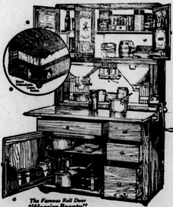
The Famous Roll Door "Hoosier Beauty"

Can be bought on small weekly payments. See our window display for the latest style Hoosiers on the market.