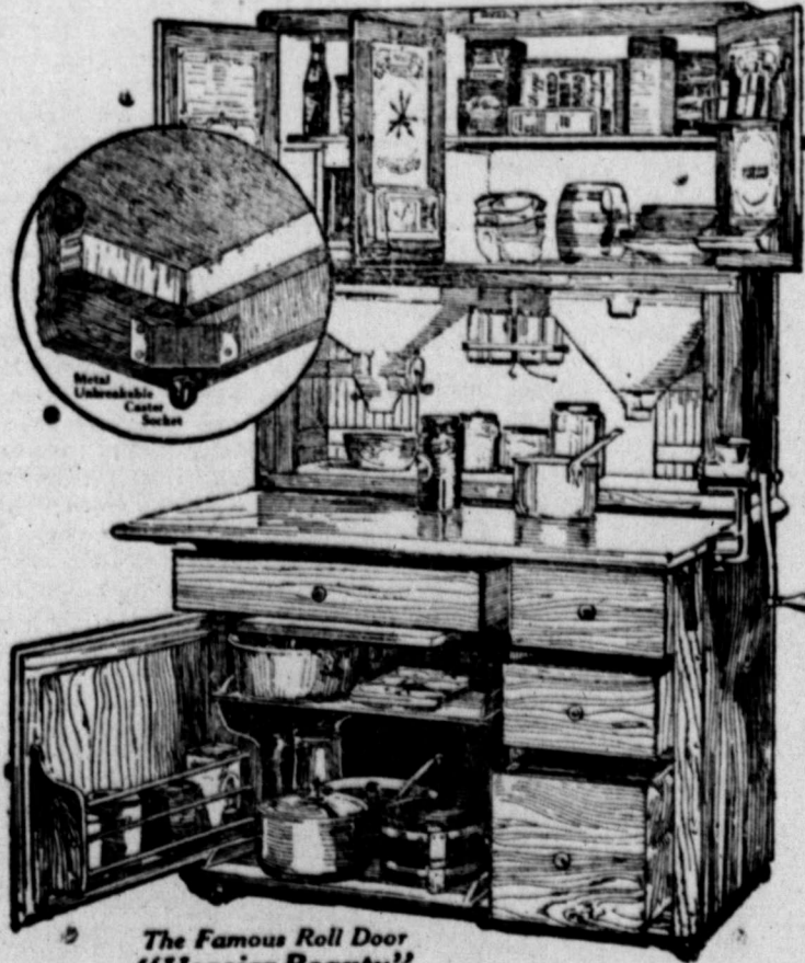
The Famous Roll Door "Hoosier Beauty"

by its style and quality. We have furniture of both style and quality. Come look through our big stock. We will treat you right.