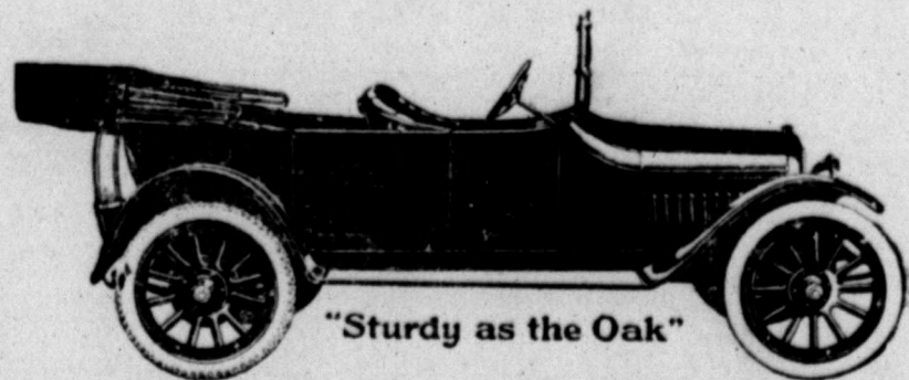
"Sturdy as the Oak"