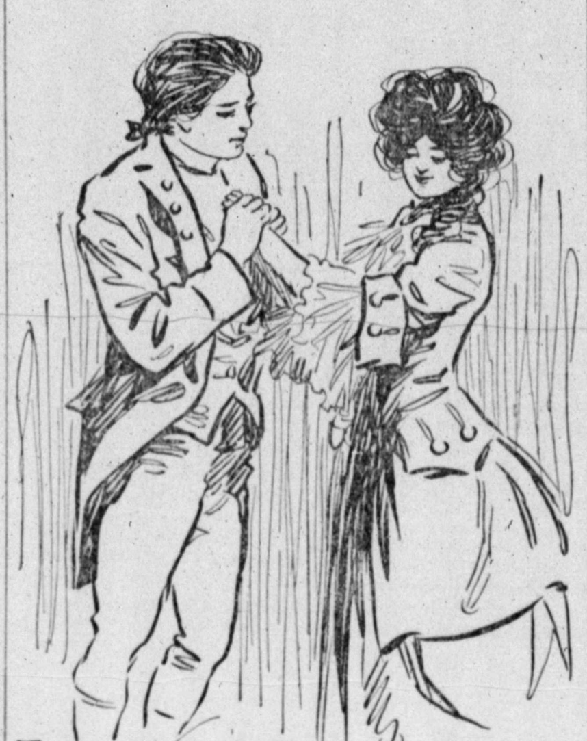
His Dark, Eager Face Was Near Hers Now

kingdom of heaven." Thus as we hastily look over these lessons from these two viewpoints, we are led to conclude with the first declaration of the Golden Text for the Cay.